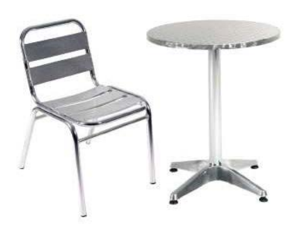
Figure 1: Furniture Examples